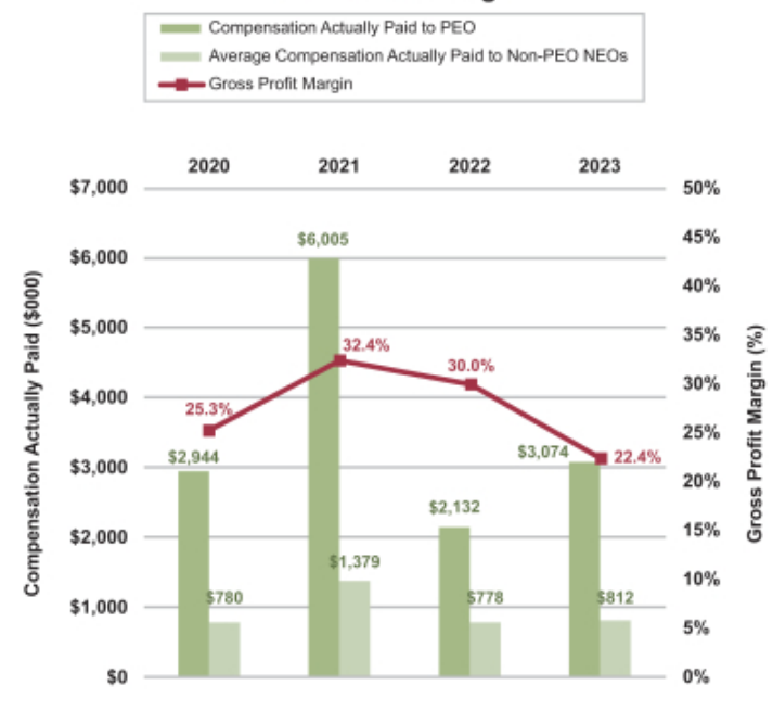
Compensation Actually Paid vs. Gross Profit Margin